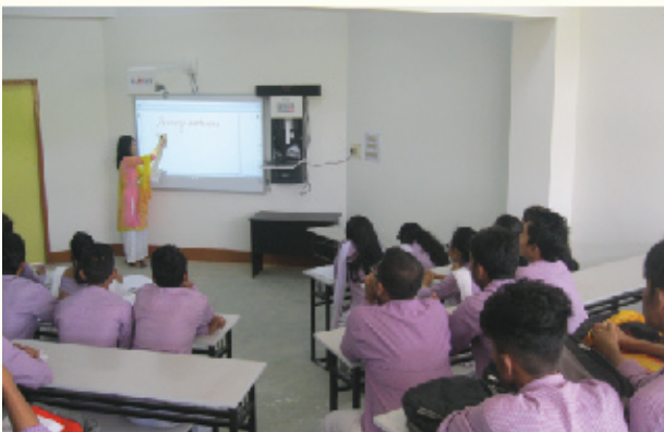
SMART CLASS ROOM