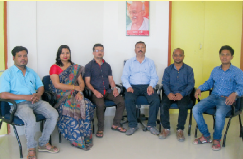
Prospectus, Academic Calender and Class Routine Perparation Committee