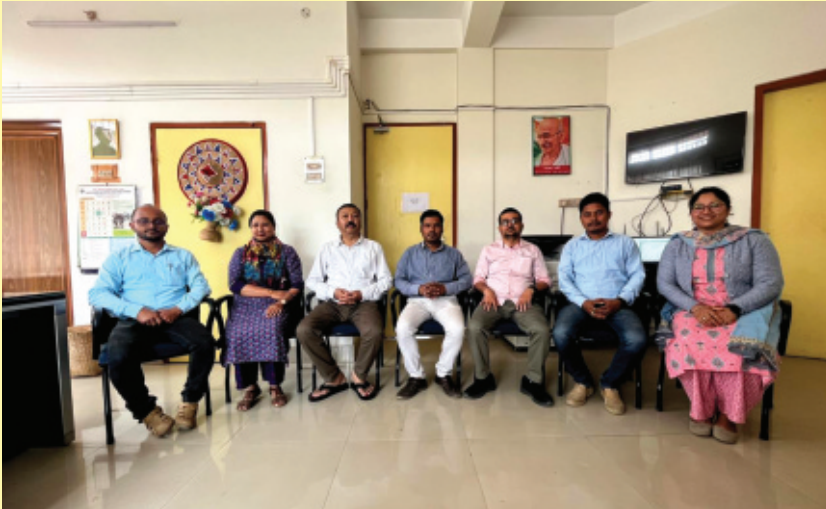
Prospectus, Academic Calender and Class Routine Perparation Committee